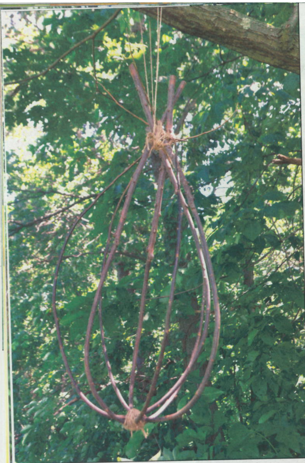
Above is Earth Art Lab coordinator Anne Drehfal's "Willow Birdcages." Only one of her three "birdcages" that are part of the piece is depicted in the photo.

“The title of our piece is ‘Unexpected Archway.’ We discovered a natural arch formed by an oak tree right off the path,” Gomez said. “A vine growing around the oak created a natural canopy. We initially tied a large grapevine to form the basic structure of the piece, creating ‘windows’ onto the landscape beyond. Next, we wove in milkweed stems, pear tree cuttings and finally tied on