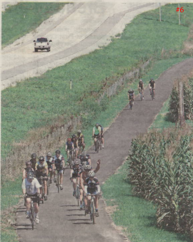
SUBMITTED Participants in the Tour de Fort bike ride on the new extension of the Glacial River Trail between U.S. Highway 18 and County Highway J in 2011.

Brook Gardens Place annual free summer carnival: 11 A.M. TO