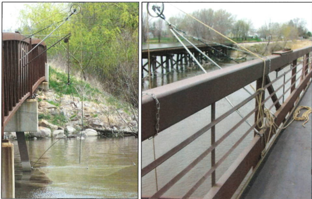
Typical Fishing Hardware Attached to Superstructure Rail

At the time of the inspection, local fishermen were utilizing the structure to “dip” for fish. Their fishing gear was attached to the railing of the bridge but did not appear to cause any damage to the structure. From a bridge maintenance standpoint I do not have any concerns with them utilizing the structure in this manner.