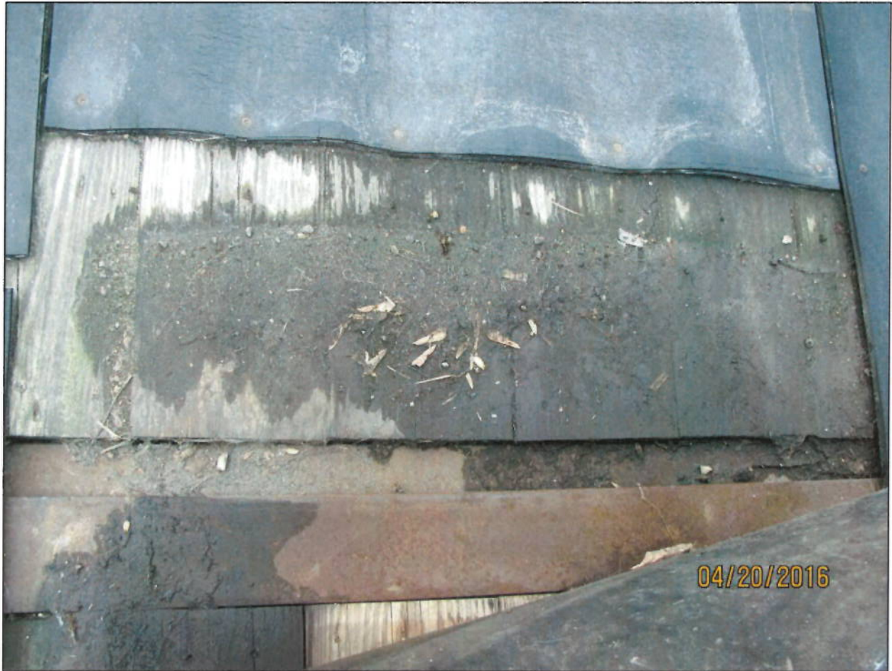
Typical Trapped Moisture and Dirt under Conveyor Belt